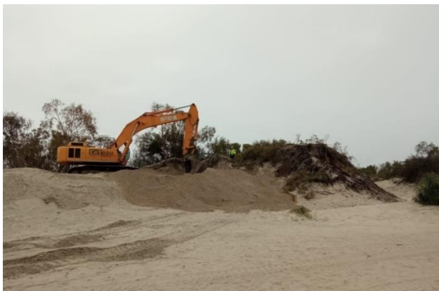
Heavy duty excavation ongoing