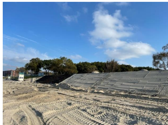
Artificial dike is created instead of a dune

Construction of the bike path is ongoing within the CBCycle Project: Cross-border cycle routes for promotion and sustainable use of cultural heritage (PR/LIP/02/2016), that is carried out in the framework of the Poland-Russia Cross-border Cooperation Programme 2014-2020 , co-financed by the European Union and the Russian Federation. It is even more important that the project activities are carried out with due environmental diligence, respecting and complying with both national and international nature protection obligations.