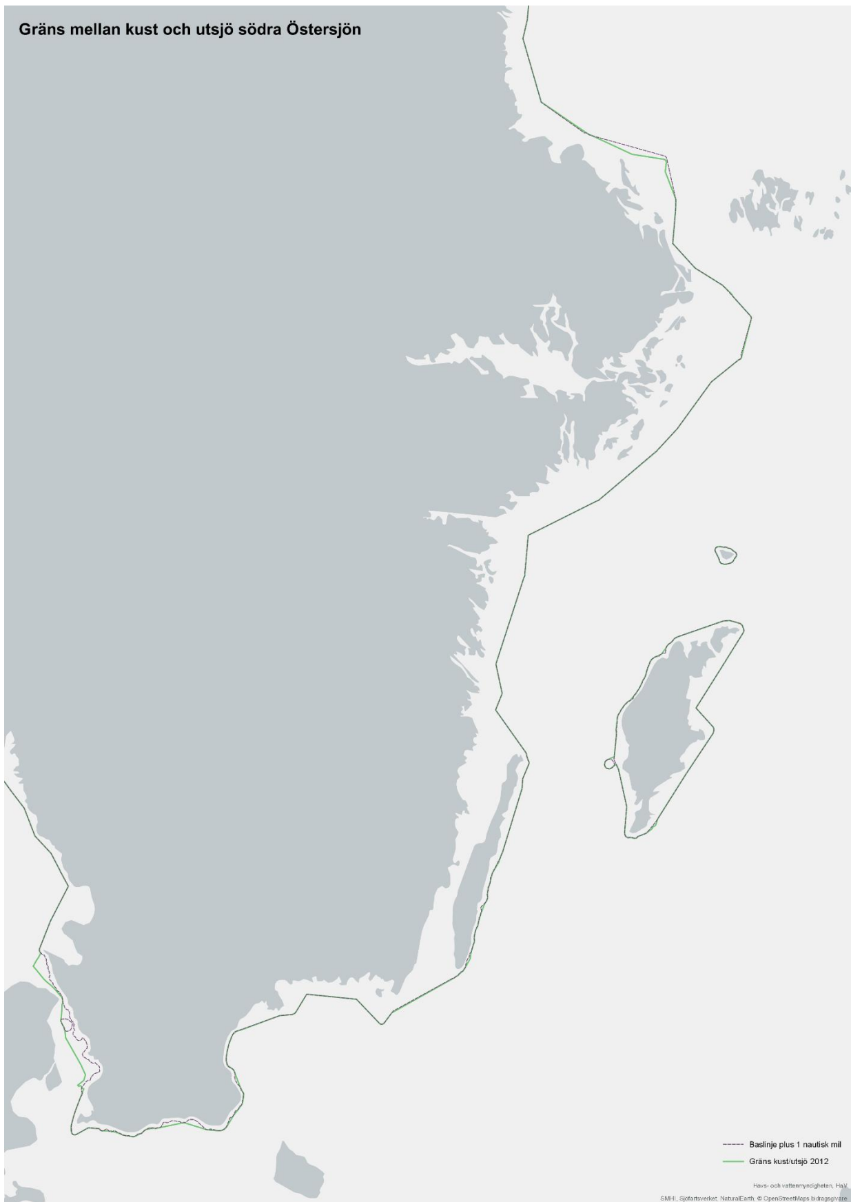
Figure 2. Gräns mellan kust och utsjö södra Östersjön = Border between coastal and off shore area Baltic Sea proper. Green line outdated border, black dashed line, updated border.