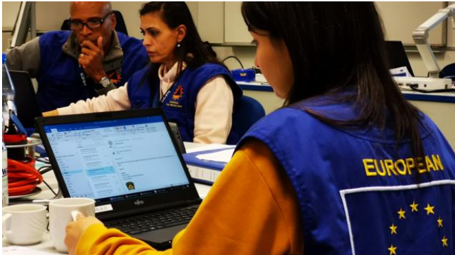
Table top exercises