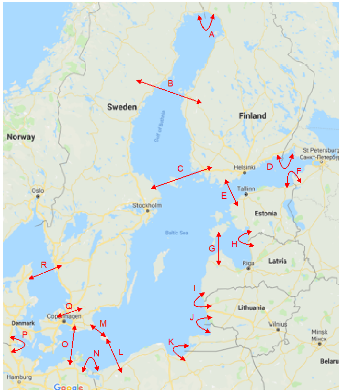
Graph A: Map of interaction between member states during incidents (for explanation of letters see adjacent list)