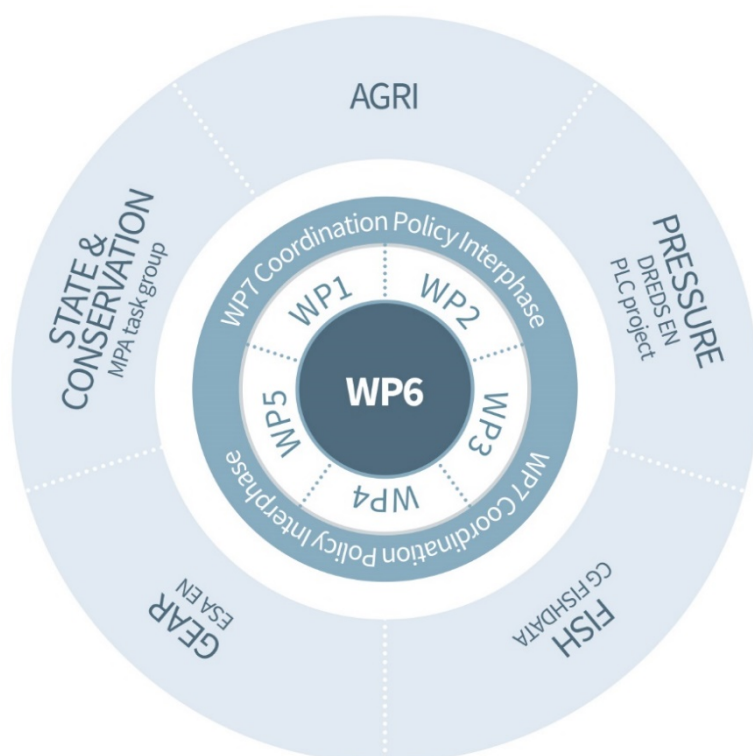
Figure 3. Management and supervision of the ACTION project.

The ACTION project will be guided through the existing working arrangement in HELCOM (see Figure below). This includes guidance from the Working Groups HELCOM GEAR, State & Conservation, Pressure, Fish and Agri, each consisting of officially nominated representatives of the Baltic Sea countries and the EU. Regular reporting to and review by HELCOM Working Groups forms the quality control of the project. The project will be closely linked to the BSAP update process in HELCOM involving all Contracting Parties. Competent authorities in the Baltic Sea countries as well as the European Commission will thus act as an advisory board to the project and will be able to oversee that the project follows the agreed priorities and that it remains relevant for national work, including regarding MSFD as far as EU countries are concerned.